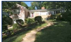
9816 Kensington Parkway Kensington/Rock Creek Hills List Price - $799,000