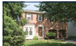
2 Campbell Court Kensington/Rock Creek Hills List Price - $619,000