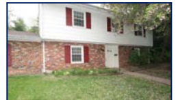
5 Orleans Terrace Kensington/White Flint Park List Price - $695,000