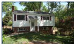
10201 Grant Avenue Silver Spring/Capitol View Park List Price - $299,000