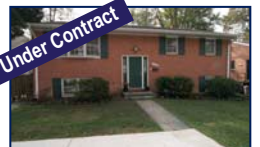
Under Contract 4508 Clearbrook Lane Kensington/Martin's Add CCView List Price - $559,000