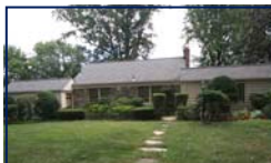
9729 W. Bexhill Drive Kensington/Rock Creek Hills List Price - $645,000