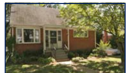
5020 Druid Drive Kensington/Garrett Park Est. List Price - $469,000