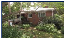
10123 Cedar Lane Kensington/Chevy Chase View List Price - $535,000 "As-Is"