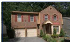
9847 Campbell Drive Kensington/Rock Creek Hills List Price - $639,950