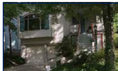
10111 Meadowneck Court Silver Spring/Capitol View Park List Price - $659,000