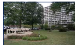
3333 University Blvd. # 508 Kensington/The Waterford FOR RENT - $1,795