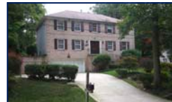
9703 Stoneybrook Drive Kensington/Rock Creek Hills List Price - $719,000