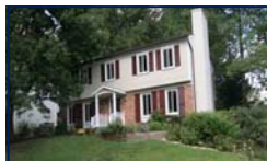
10101 Day Avenue Silver Spring/Capitol View Park List Price - $529,000