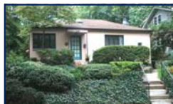
508 New York Avenue Takoma Park/Takoma Park List Price - $399,000