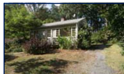
3007 Jennings Road Kensington/Oakland Terrace List Price - $220,000 "As-Is"