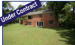
Under Contract 4016 Everett Street Kensington/Chevy Chase View List Price - $729,000