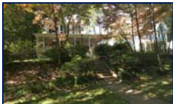
11104 Kenilworth Avenue Kensington/Garrett Park List Price - $1,000,000 "As-Is"