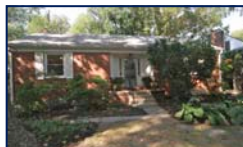
10010 Frederick Avenue Kensington/Kensington List Price - $550,000