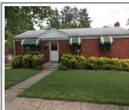
4805 Oxbow Road Rockville/Randolph Hills Sold June 21, 2011 $310,000