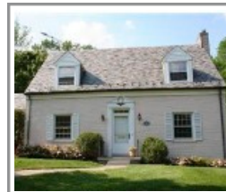
3805 Club Drive (*) Chevy Chase/Chevy Chase Sold July 6, 2011 | $810,000