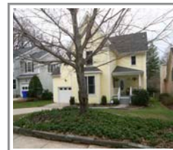
10015 Leafy Avenue Silver Spring/Capitol View Park Sold May 20, 2011 | $701,500