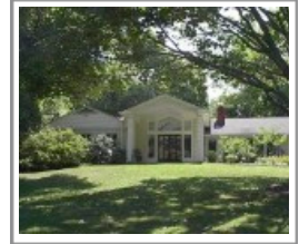
14613 Peach Orchard Rd. (*) Silver Spring/Fairland Acres Sold July 25, 2011 $499,000