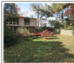
3303 Pendleton Drive Silver Spring/PT Wheat. Out Sold June 24, 2011 $365,000