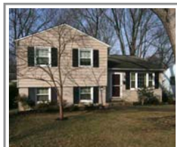
612 Edmonston Drive (+) Rockville/Burgundy Estates Sold April 29, 2011 $345,000