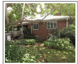
10123 Cedar Lane Kensington/Chevy Chase View Sold April 15, 2011 $520,000