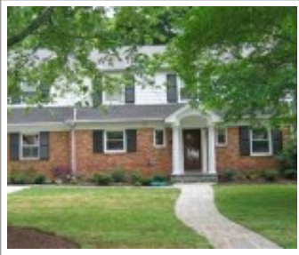
9636 Culver Street (*) Kensington/Rock Creek Highlands Sold June 27, 2011 | $932,000