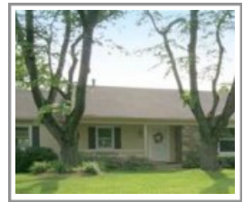
15204 Wyclife Court (*) Rockville/Norbeck Manor Sold June 30, 2011 $580,000

Sales Reported are from January 1, 2011 - July 31, 2011. Information gathered from the Metropolitan Regional Information System, Inc.