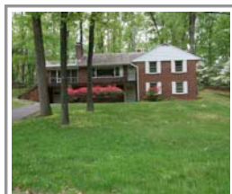
12012 Auth Lane Silver Spring/Springbrook For. Sold July 26, 2011 $480,000