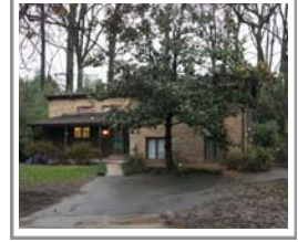
11301 Soward Drive Kensington/Kensington Knolls Sold March 31, 2011 $496,460