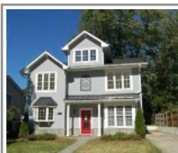
3213 Edgewood Road (*) Kensington/Homewood Sold Feb. 23, 2011 $460,000