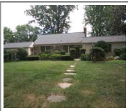
9729 W. Bexhill Drive Kensington/Rock Creek Hills Sold March 1, 2011 $600,000