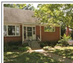
5020 Druid Drive Kensington/Garret Pk Est. Sold May 26, 2011 $459,000