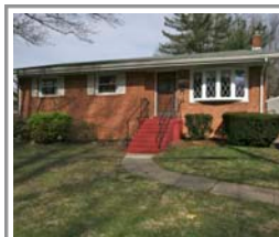
11318 Newport Mill Road Silver Spring/Hammond Woods Sold May 27, 2011 $297,000