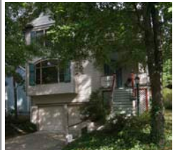
10111 Meadowneck Court Silver Spring/Capitol View Park Sold Feb. 22, 2011 $615,000