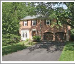
2 Campbell Court Kensington/Rock Creek Hills Sold Jan. 13, 2011 $619,000