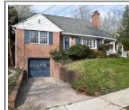
4609 Woodfield Road (*) Bethesda/Parkwood Sold May 27, 2011 | $725,000