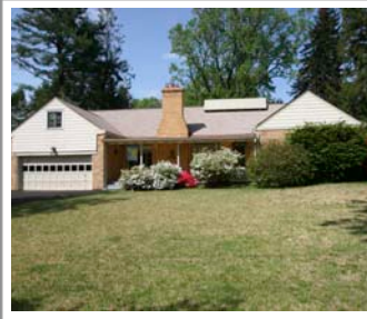
4013 Cleveland Street Kensington/Chevy Chase View Sold April 14, 2011 | $860,000