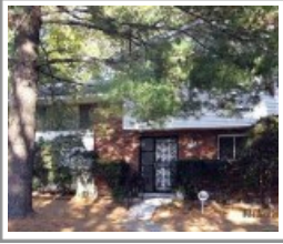
1718 Evelyn Drive (*) Rockville/Montrose Sold March 31, 2011 $625,000