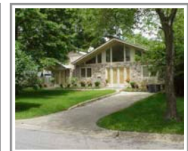
9909 Parkwood Drive Bethesda/Parkwood Sold June 17, 2011 | $ 675,000