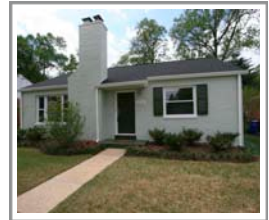
4518 Dresden Street Kensington/Chevy Chase View Sold July 26, 2011 $562,000