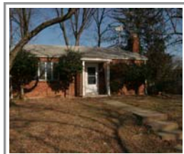
10152 Crestwood Road Kensington/Parkwood Sold Feb. 10, 2011 $400,000