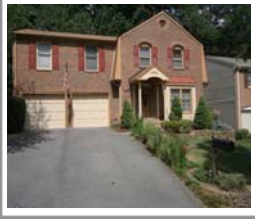
9847 Campbell Drive Kensington/Rock Creek Hills Sold May 25, 2011 $615,000