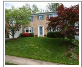
10805 McComas Court Kensington/Kensington Heights Sold July 25, 2011 $495,000