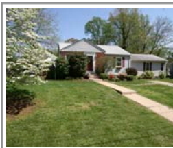
11011 Harriet Lane Kensington/N. Kensington Sold June 30, 2011 $395,000