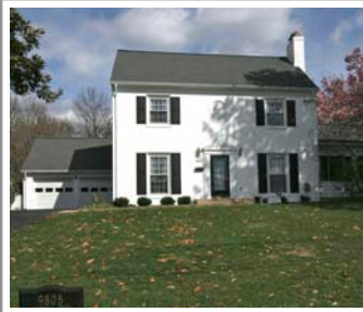
9805 Haverhill Drive Kensington/Rock Creek Hills Sold May 25, 2011 | $875,000