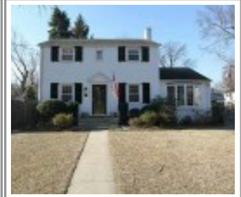
4922 Redford Road (*) Bethesda/Greenacres Sold April 15, 2011 | $815,000