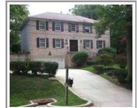
9703 Stoneybrook Drive Kensington/Rock Creek Hills Sold Jan. 28, 2011 | $705,000