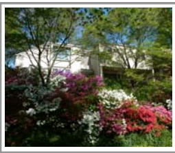
9820 LaDuke Drive Kensington/Rock Creek Hills Sold Feb. 15, 2011 $669,000