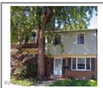
26 County Ct. # 17-4 (*) Gaithersburg Shady Grove Village Sold - March 25, 2010 $240,000

HEY KIDS! Bring this coupon and get a free small pumpkin from Hawkins Produce