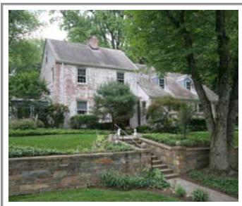
9506 E. Stanhope Rd., Kensington Rock Creek Hills Sold - August 13, 2010 $902,500

Home Sales in Kensington and neighborhoods in Bethesda, Chevy Chase and Silver Spring From January 1, 2010 through August 31, 2010