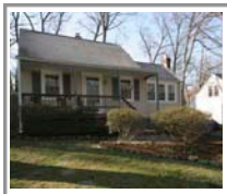
3304 Ferndale Street Kensington Homewood Sold - June 1, 2010 $460,000