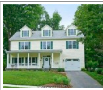
10206 Greenfield St., Kensington (*) Martin's Add. to Chevy Chase View Sold - August 20, 2010 $840,000