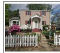
10415 Hebard Street Kensington Kensington Estates Sold - August 31, 2010 $722,000