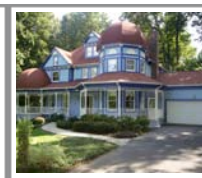
9220 Clematis Court, Gaithersburg Woodfield Estates Sold - April 29, 2010 $725,000