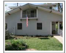
4222 Warner Street Kensington Kensington Terrace Sold - August 10, 2010 $580,000