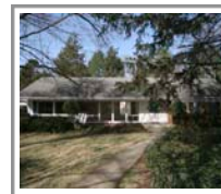
4115 Everett St., Kensington Chevy Chase View Sold - June 30, 2010 $732,500