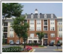
9405 Blackwell Rd. #103 (*) Rockville Falls Grove Sold - March 25, 2010 $345,000