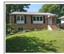
3816 Lawrence Ave. Kensington North Kensington Sold - September 3, 2010 $400,000