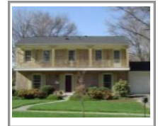
1498 Dunster Lane (*) Potomac Potomac Woods Sold - June 3, 2010 $635,000