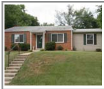
4213 Anthony Street Kensington Kensington Estates Sold - August 17, 2010 $479,000