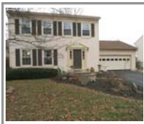
13531 Spinning Wheel Dr. Gaithersburg Churchill Town Sector Sold - August 25, 2010 $345,000