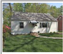
3109 Plyers Mill Road Kensington Oakland Terrace Sold - September 13, 2010 $319,000