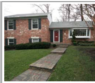
4105 Byeforde Court, Kensington Byeforde Sold - April 15, 2010 $745,000