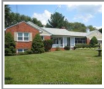
16629 Alden Ave. (*) Gaithersburg Rosemont Sold - March 31, 2010 $420,000