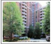
4808 Moorland Ln. #710 (*) Bethesda The Christopher Sold - May 21, 2010 $480,000