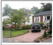
3812 Lawrence Ave. (*) Kensington North Kensington Sold - April 30, 2010 $475,000