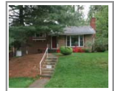
9304 Chanute Drive Bethesda Parkview Sold - August 20, 2010 $565,000