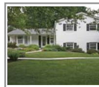
11232 Waycross Way Kensington White Flint Park Sold - August 20, 2010 $665,000