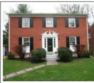
6002 Beech Ave., Bethesda (*) Alta Vista Terrace Sold - May 17, 2010 $760,000