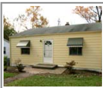
9902 Capitol View Ave. Silver Spring Capitol View Park Sold - February 12, 2010 $255,000