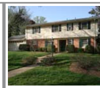
4201 Culver Street Kensington Byeforde Sold - June 14, 2010 $690,000