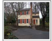
10112 Meadowneck Crt. Silver Spring Capitol View Park Sold - June 4, 2010 $535,000