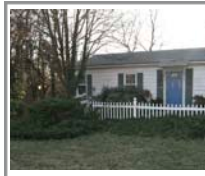
9900 Capitol View Ave. Silver Spring Capitol View Park Sold - March 31, 2010 $315,000