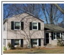
612 Edmonston Dr. (*) Rockville Burgundy Estates Sold - April 30, 2010 $345,000