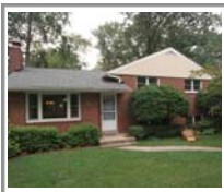
10703 Brunswick Ave. Kensington Kensington Heights Sold - August 20, 2010 $399,000

www.HomeSaleValuesBethesda.com www.HomeSaleValuesChevyChase.com www.HomeSaleValuesKensington.com www.HomeSaleValuesSilverSpring.com