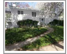
11222 Orleans Way Kensington White Flint Park Sold - June 9, 2010 $645,000