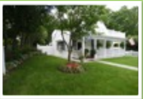
3414 Wake Drive Kensington/Kensington $ 589,000