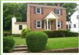
4304 Ambler Drive Kensington/Kensington Est $ 575,000