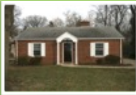
4115 Warner Street Kensington/Warners Kensington $ 465,000