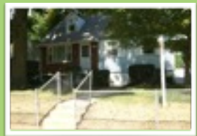
4009 Spruell Drive Kensington/Rock Creek Palis $ 399,000